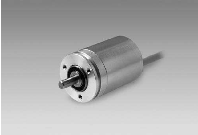
BMMV 30 SSI with shaft